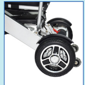
Pictures and specifications are for reference only and may differ slightly.