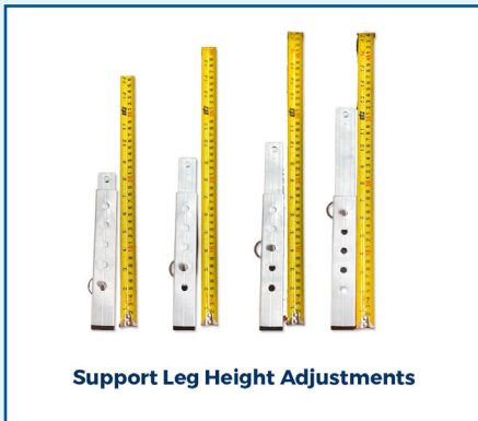
Support Leg Height Adjustments