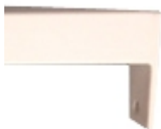
Table Post Bottom

Step 1: Align table post with two holes in base ensuring the tab is positioned over the hole in the caster bar. Insert screws and tighten.