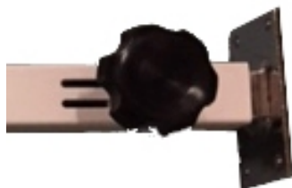
Table Post Top

Step 2: Align four holes in table post top plate with the four holes in table top bracket. Ensure the base is positioned under the table. Insert four bolts, screw nuts on and tighten.