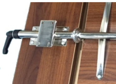
Table Top Bracket